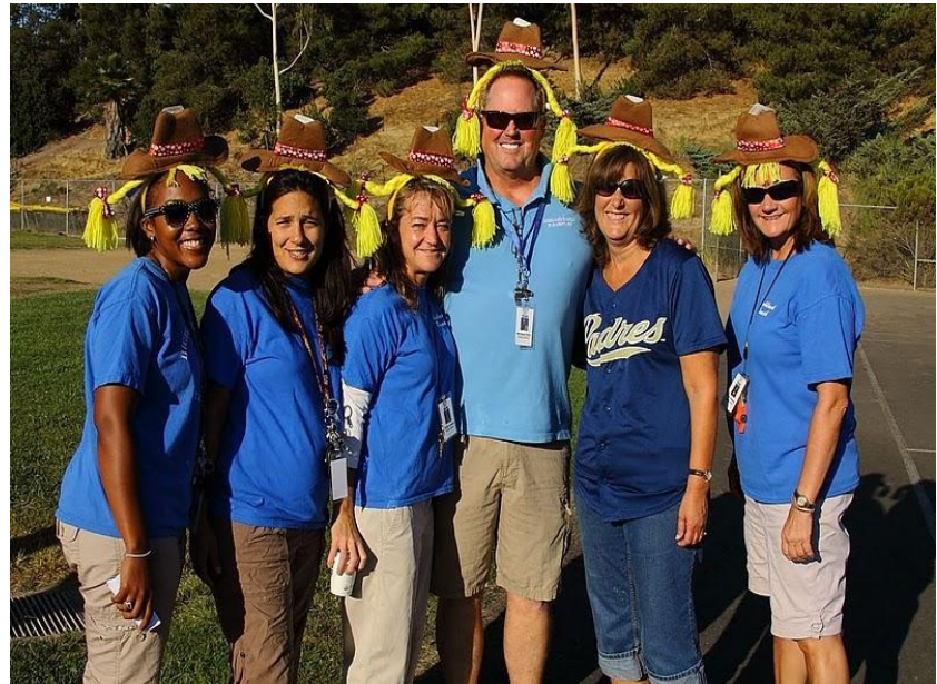
Our wonderful 4 th & 5 th Grade Teachers