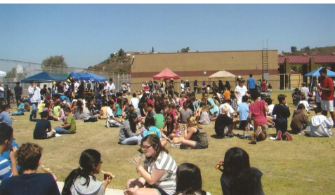
The top field was teeming with very active students who had fun, games and a delicious snack at this year's summer picnic.

As usual, it was a warm sunny day when parents and friends descended on the upper field at 9:30 am with canopies, folding tables and chairs, ice-filled coolers, loads of water balloons and such disparate items as cans of whipped cream, cans of marking paint, hammers, gunny sacks and rope; not to put on the latest version of the Highland Games but to pair-up and arrange 16 wet and wild fun games around the perimeter. Space was left on one side for food and drinks and a board set up to show raffle prizes and, within an hour, everything was ready! When the students arrived after an abbreviated morning session, voilà! the music started, personal pan pizzas were delivered and the fun began.