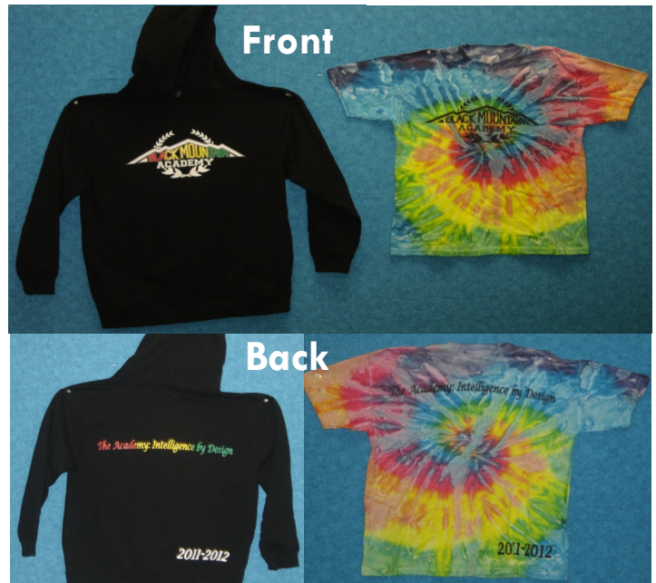
New Academy wear will soon be available to purchase. (Black tee-shirt not shown).

All proceeds from sales go to the Academy Donation Account.